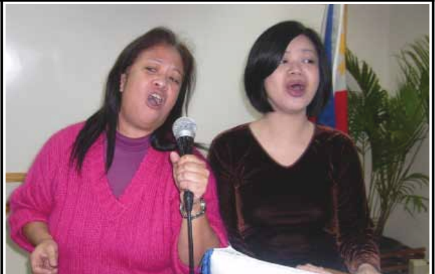
The RCB "Supremes"