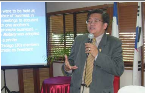
Fellow Rotarians of RCB, if you can still recall, this is how it started.