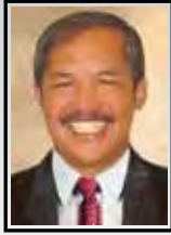
Captions by: IPP Bert Talco