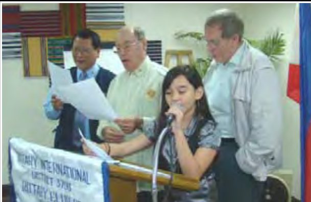
The "French Quartet" is in town!