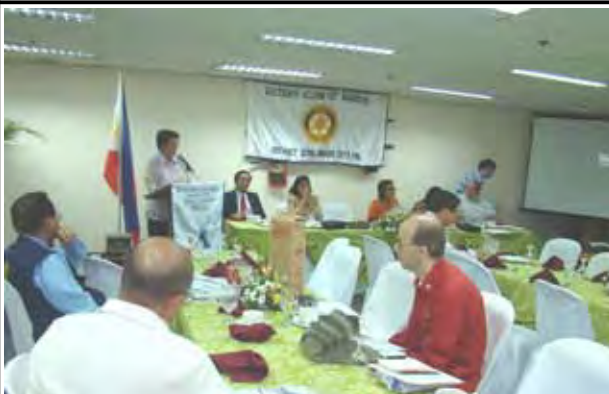
DGN Digna influencing everyone to recruit quality members.