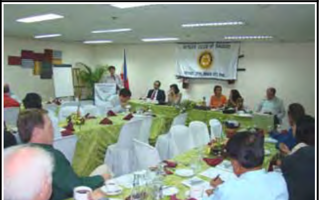
Even the Noise Makers were attentive to learn more about recruiting members.