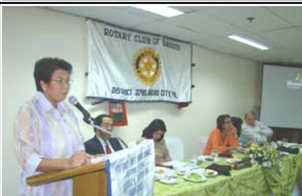
Very important to our Club is to increase in number.