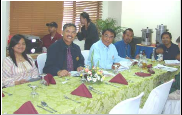
All smiles... Happy to be together as RCB members.