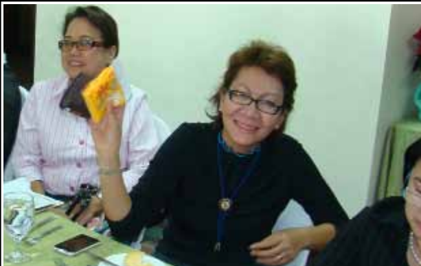
PN Mia proved the saying "better late than never" as she still won in the raffle draw.