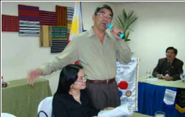
Rtn. herb was a smooth singer, Rtn. Flo cannot help but smile with glee.