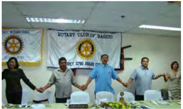
For RCC Representative Caligtan, Rotary is just a "holding hands" away.