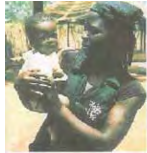
Same child after 3 months with Spirulina

All these can be provided in a spoonful of Spirulina each day. Malnutrition usually involves also a lack of calories which are obtained through energy foods such as cereals, fats and oils.