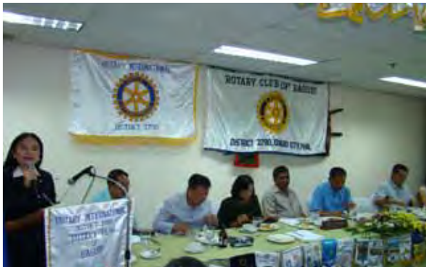
Rtn. Flo's finest moment just revealed that there's a lot of activity going on in the club.