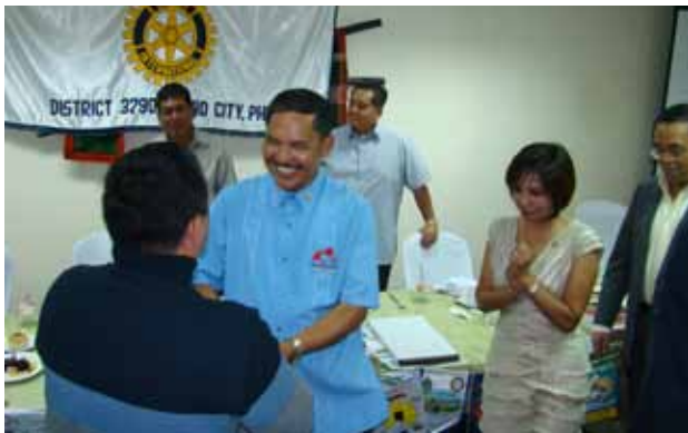
The President is not exempted in the ice cream treat, right birthday boy?