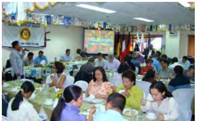
Full House... it's easy really if we want to.