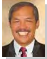
Captions by Pres. Bert Talco