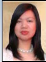
Captions by EIC Dhory Vicencio