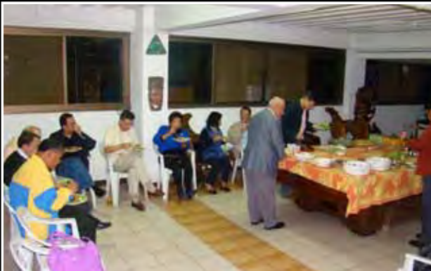
Everybody was minding his own business or should I say dinner?