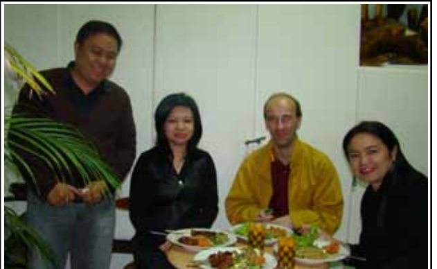
We knew the cam was clicking, no one dared to eat on cam...smile!