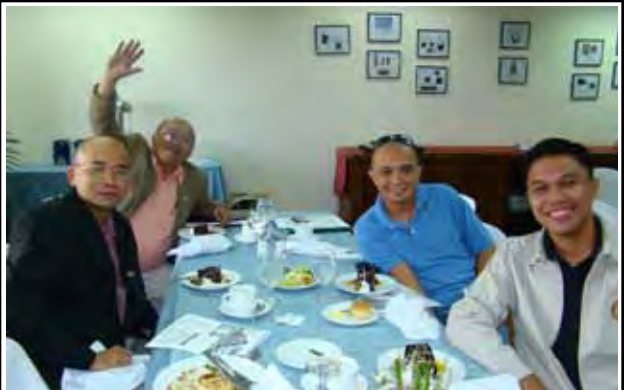
RC Sunrise – friends from Rotary Club of Sunrise graced our meeting. Thank you for joining us.