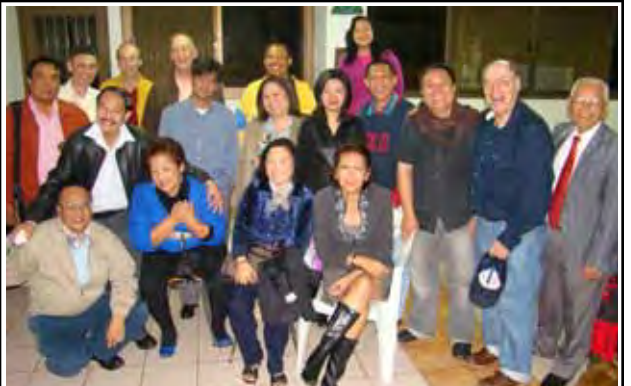
The first fireside chat for this Rotary year was a great success. Congratulations to all!