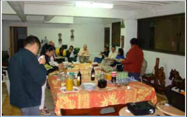
The recreational room of PP Gerard's residence suddenly became RCB's haven.