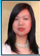
Captions by EIC Dhory Vicencio