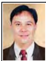
The TRF and Memberships Seminar That Was 23 August 08