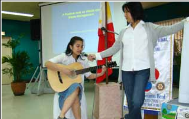
RAPP Cynch became a "stage mother" in another impressive entertainment presentation.