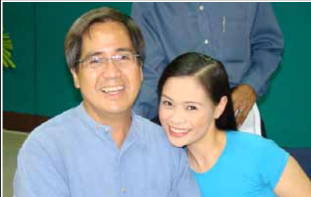
Father and daughter team up never fails to make us appreciate family day.