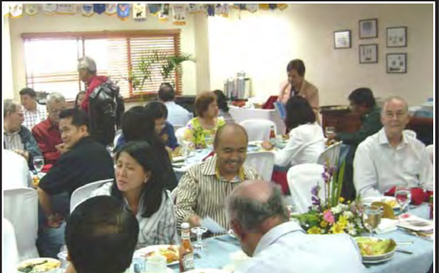
The BCC Wolfson room was filled with a good number of RCB Rotarians, Anns and guests.