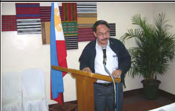
Our VP is back. Everybody thought he was the third speaker. Nonetheless, he gave a good Response.