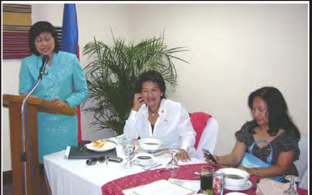
PP Veeh gave a very sound charging, the definition of R.O.T.A.R.I.A.N