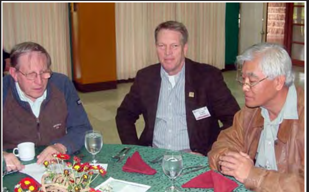
Three is a crowd. Who can guess what they are thinking of? Definitely, not each other.