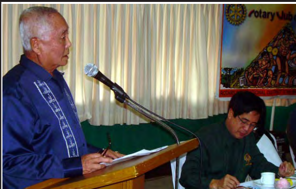
"I don't get it. I come up to the rostrum and everybody laughs. I cracked a joke and you stop"