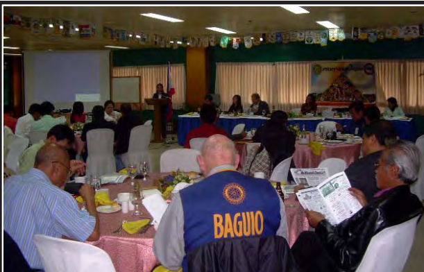
The Rotary crowd that attended the Saturday's meeting.