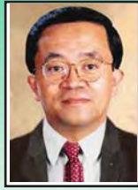
Synopsis/Captions by Pres. Raffy Chan