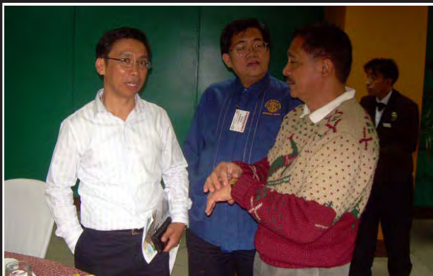
"No chance for your putting up a hospital down under. What they need are vets for kangaroos"