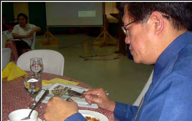
This is a balanced diet I'm having. By balance I mean 50/50 chance of survival.