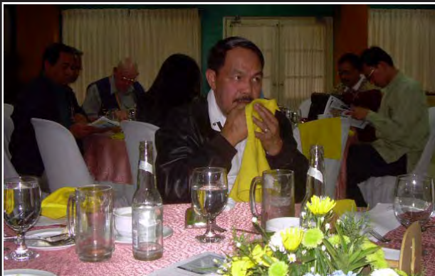
The be-moustached, VP Ben demonstrates the proper etiquette after a sumptuous Rotary meal.