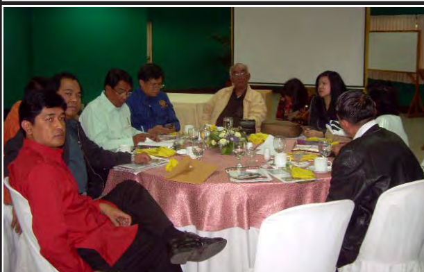
The working committee patching up loopholes for the 70th anniversary of RCB.