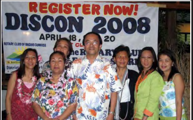
The only thorn among the RCB Sunrise roses (above) reminds our members to join DISCON 2008 come April.