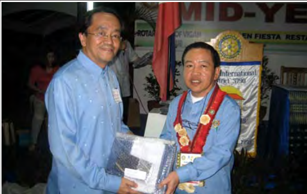
Your president as he accepted the PHF certificates, medallions and pins for the two PHFs he donated.