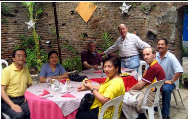
We stayed at the Giorgio's Hotel in Vigan. The morning after, breakfast was with more fellowship.