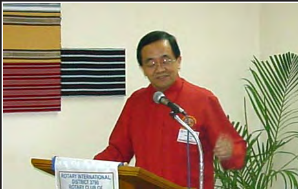
Pres. Raffy, are you playing some hand magic tricks up there at the rostrum?