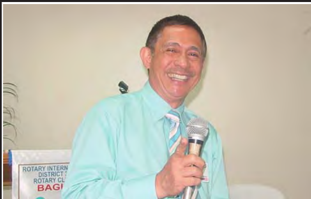
PP Diony, you have been dubbed as the "Frank Sinatra" of the club. Clap! clap! clap!