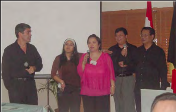
A real treat for Ladies' Day as the "Men In Black" and "Spice Girls" gave us ultimate entertainment.