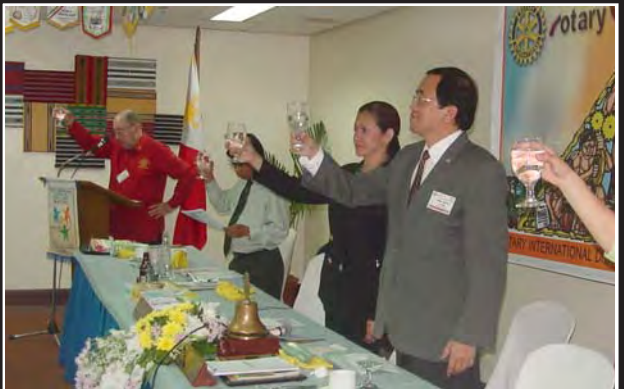
Our French Program Coordinator led the toast for Rotary Club of Somerset Pulaski County.