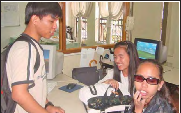
Even without eyesight they smile for us and express their appreciation during our short visit.