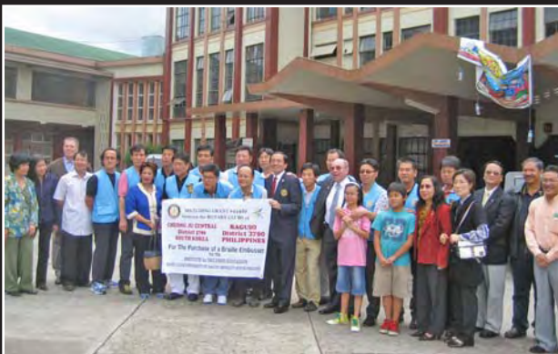
Posterity pose shows a number of the Rotarians and guests enjoying the camaraderie on that day.