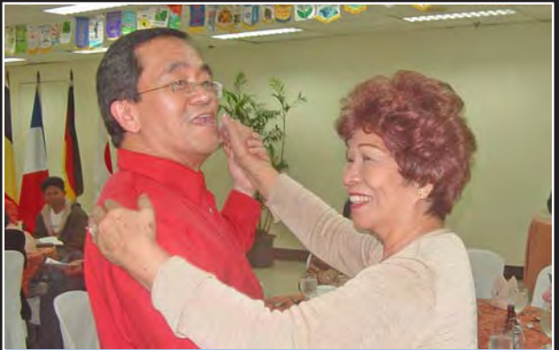
The president's opening waltz to open each Family Day Meeting is now becoming a standard modus operandi.