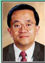
Captions / Synopsis by Pres. Raffy Chan