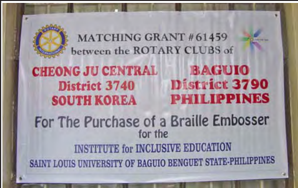
This tarpauline sign was our welcome banner for our brothers from RC Cheong Ju Central of South Korea.

Looking at the blind workers of the institute reinforced appreciation that we are indeed fortunate to be able to serve our needy brethren by way of donations like these.