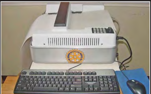
Do not under-estimate the power of this small machine. It cost US$15,800 but is worth every cent of it.