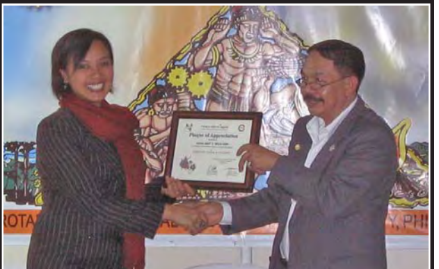
Hmmm..VP Ben thinks "It is indeed a pleasure!..to award this Plaque of Appreciation"