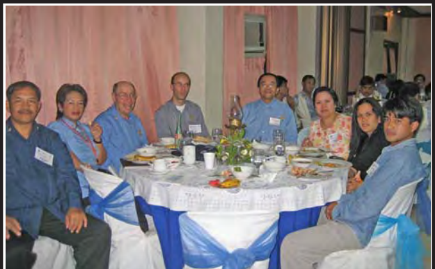
Our very own RCB delegates with a guest, looking so distinguished when seated on their places.