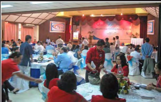
The crowd of 256 participants ...20 delegates from RCSFLU and RC La Trinidad with 11 out of 14.