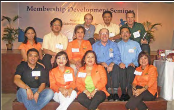
RCB Sunrise took a break with RCB gentlemen and invaded the stage for photo shoot.