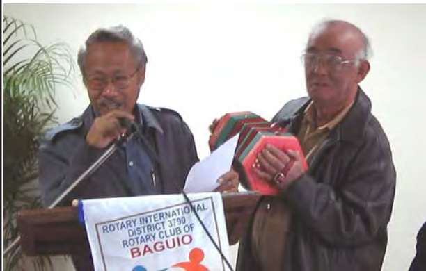
PP Roger...I didn't see your name in the programme... are you the surprise Entertainment guy?