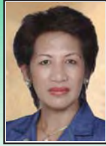
Captions / Synopsis by IPAG Linda Wlnter