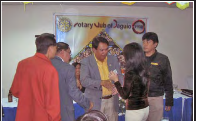
Aha! So that's why we were served with mango flavored ice cream...our birthday boy is sporting a yellow shirt.