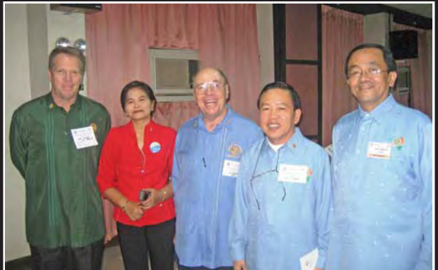
Our RCB participants during the not-so-formal photo session with DG Owens.