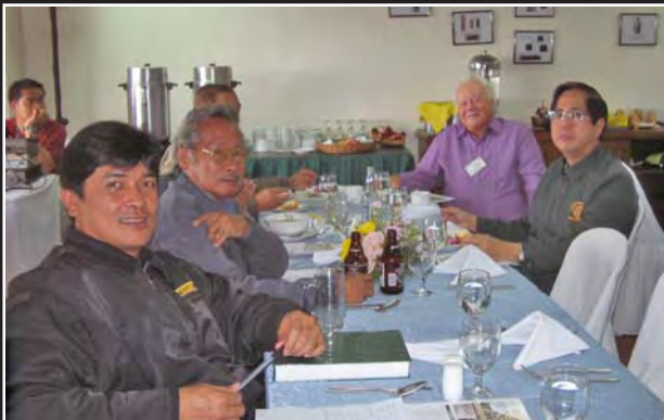
Is this somekind of beauty contest for men? Why are they all smiling so sweetly?