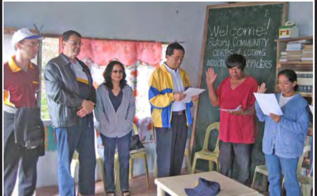
Our sporty President inducted the new officers of Luding RCC with RCB members by his side.