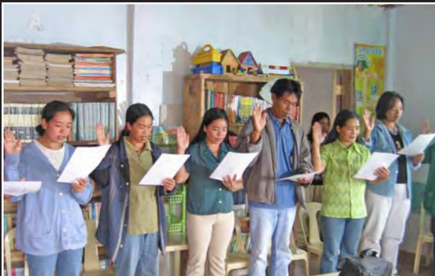
Right hands raised... Officers do solemnly swear to perform their duties.