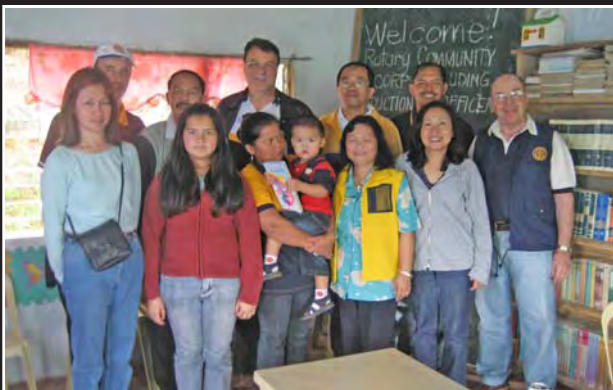
Everybody say...chiz! Enjoy the click of the camera...thank you for coming!