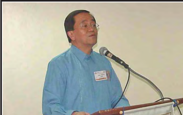
Our distinguished "Latin President" gave us the President's message..good thing ...in English!