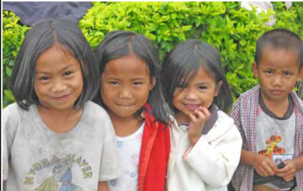
Look at those faces! Our hearts melt upon seeing their faces lightening up with our presence.