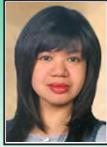
Captions / Synopsis by EIC Dhory Vicencio