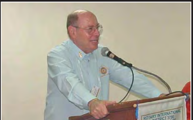
Our French IPP did the introduction of GHS in English but with French accent!