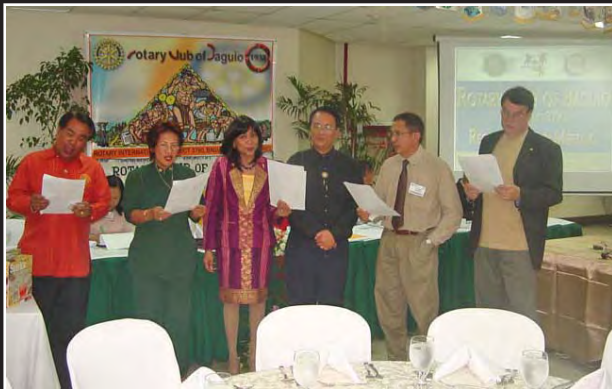
Is good singing voice a qualification for RCB President?...they surely passed with flying colors!