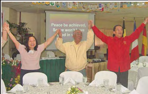
Wow! This is the Rotary way of singing the Rotary Hymn!