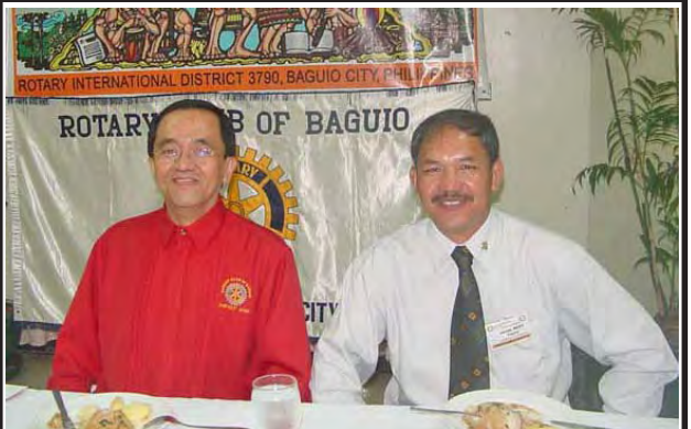
Now, this is what we may call "serious smile"... from our President and President Nominee.