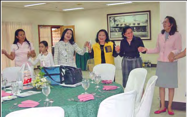
Lady Rotarians and Anns are hands together while singing the Rotary Hymn.