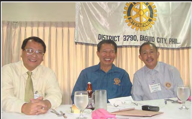
Rotarian gentlemen at the head table are definitely enjoying the club's meeting.