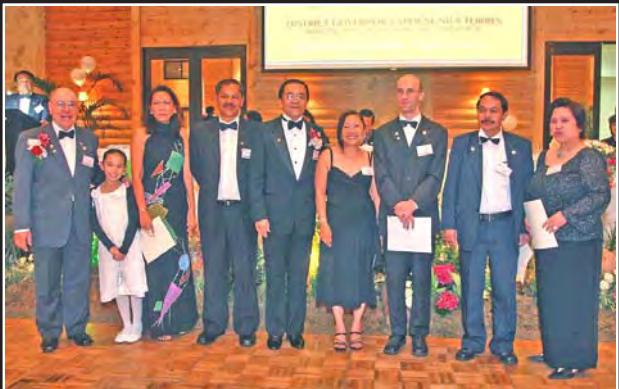
The newly inducted Directors and Officers of RCB were all smiling right after the induction.