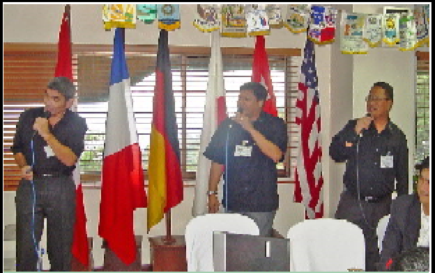
Our RCB M.I.B. reprise their act with gusto. No truth to the rumor that DYNA Records is interested though...