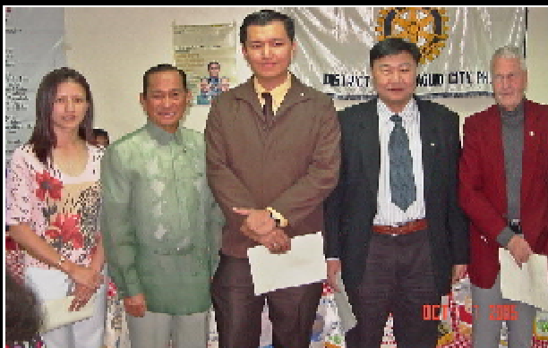
Our five new RCB members (aged from 16 to 46) should be able to contribute to our club's initiatives.