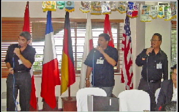
Our RCB M.I.B. reprise their act with gusto. No truth to the rumor that DYNA Records is interested though...