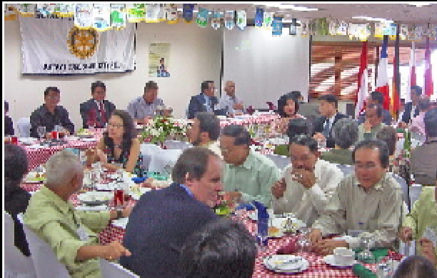
This is what all Rotary meetings should be: lots of friends to meet and many things to talk about.