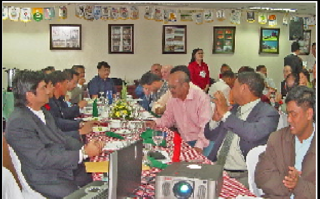
This shot is from another vantage point to re-affirm how full the Benguet Room was.