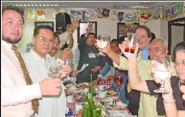
The second Toast of Fellowship to the Rotary Club of Cannes was better attended than the first.