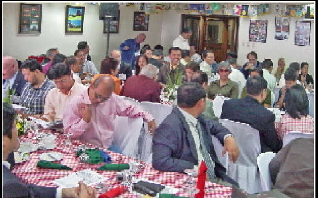
Can you see how the RCB Members are outnumbered two to one during this meeting?