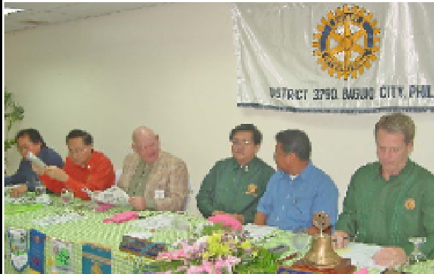
The head table was fully-loaded with Rotarians and our GHS who were preparing for a "grand" meeting.