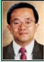
Captions by EIC Raffy Chan