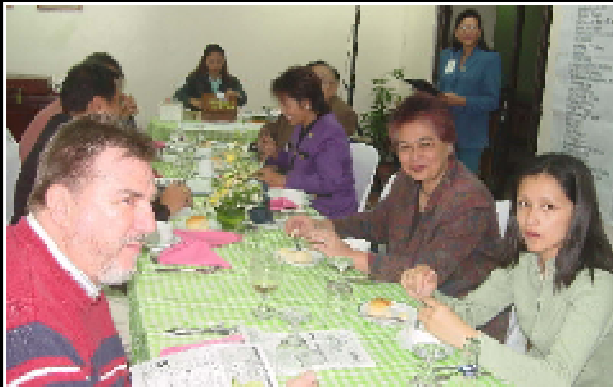
Our guests seem to be having a good time posing for the camera. Hope they will become Rotarians soon.